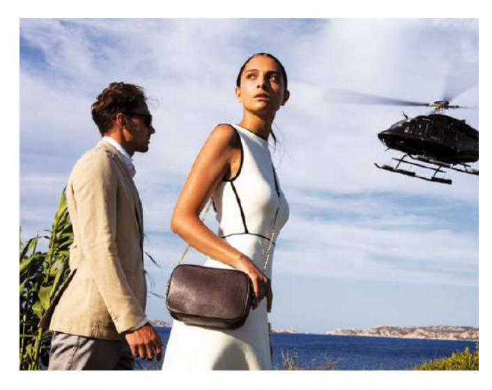
Living in a panorama. Which you can discover right from the first day, if you wish, arriving by helicopter.

Then continue, falling in love with the La Maddalena Archipelago or a hidden bay, the park around the hotel, or the suites with their own pool.