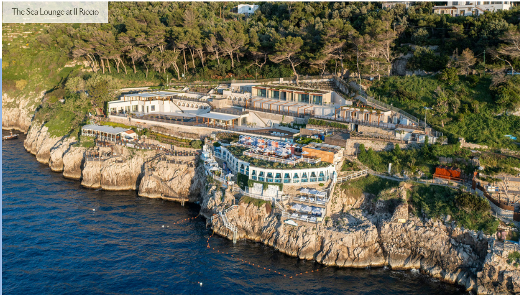
The Sea Lounge at Il Riccio