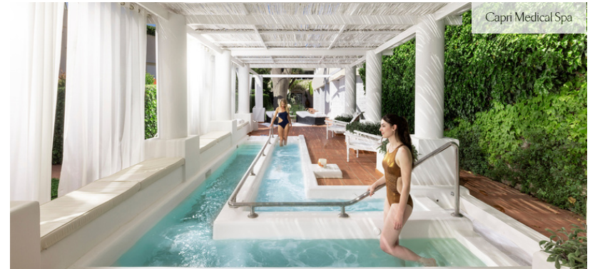
Capri Medical Spa

A diffused museum showcased inside the common areas of the Capri Palace Jumeirah. Born with the purpose of having guests experience the different areas of the hotel with fascination and harmony, conceiving the vacation also as an aesthetic experience, the project conveys art as a passion to share and transforms it into one of the founding pillars of the new hospitality.