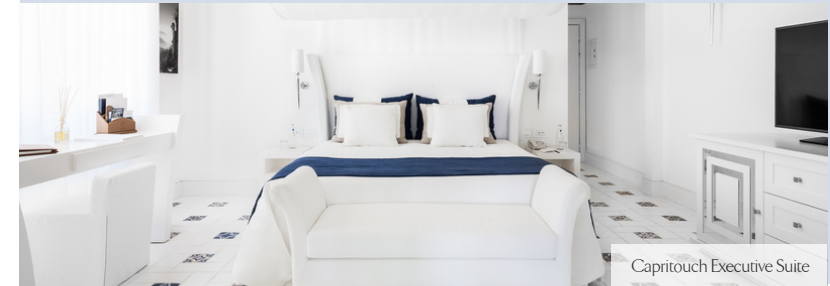
Capritouch Executive Suite