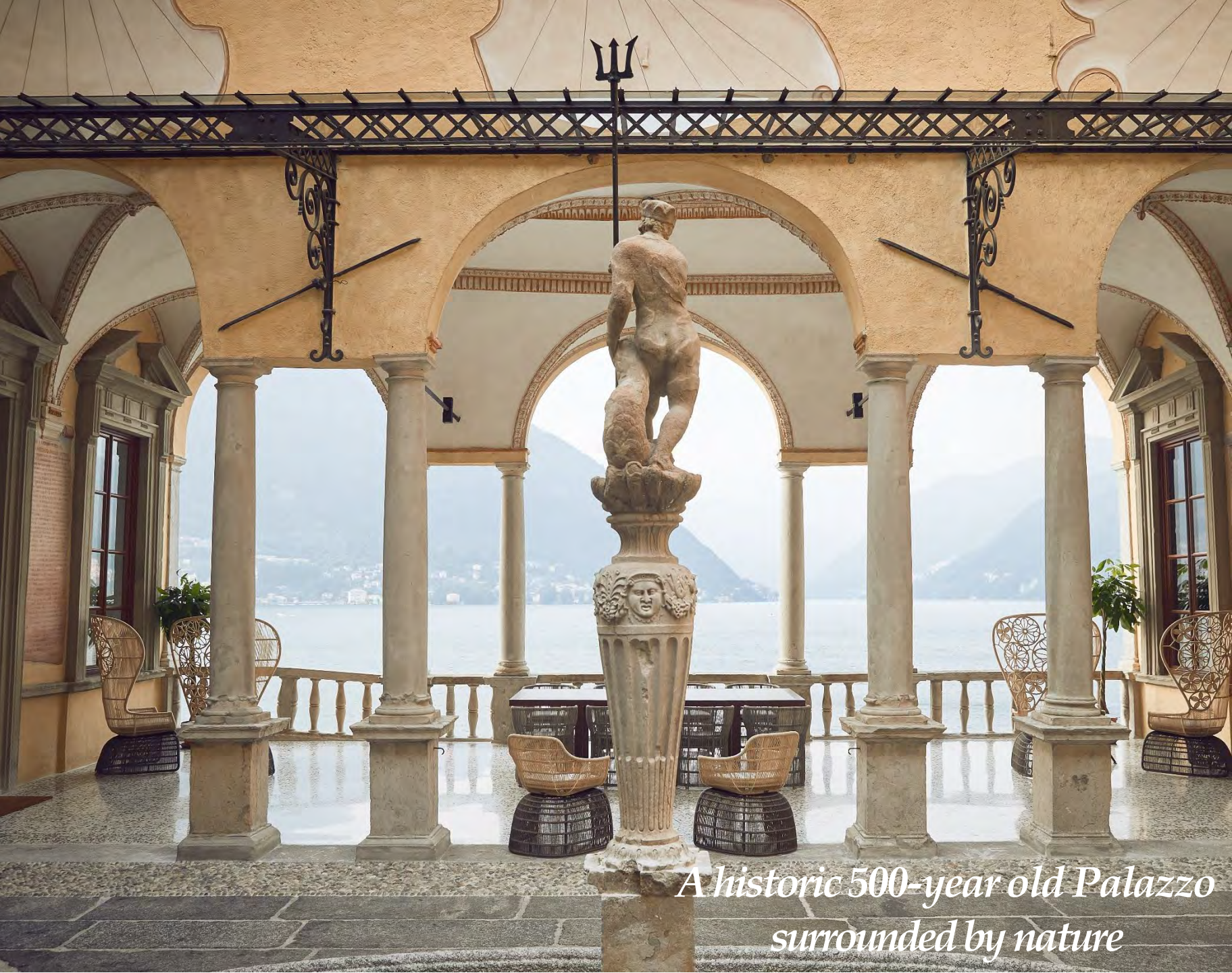
A historic 500-year old Palazzo surrounded by nature