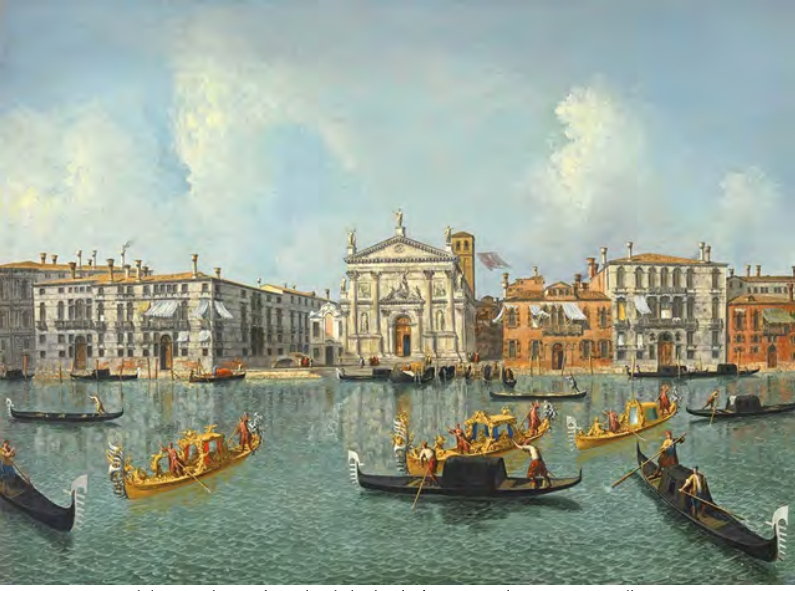
Michele Marieschi Grand Canal with the church of San Stae 18th century private collection

This ancient and eminent lineage has made the enlargements and embellishments to the palace that originally overlooked the Grand Canal, occupying the area where the garden is located today, and featured the typical Venetian fifteenth-century structure in three sections, with the entrance to the lobby facing the waterside with an L shape.