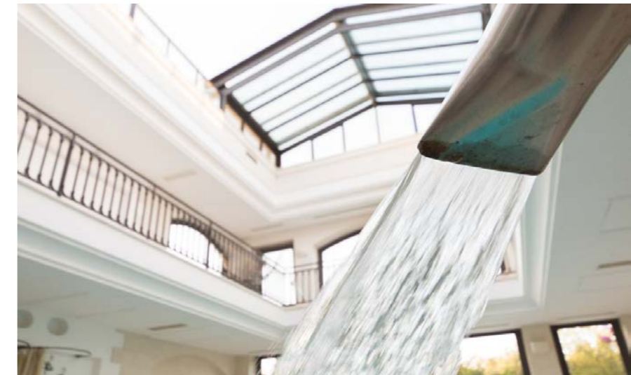
SPECIAL FOR HIM