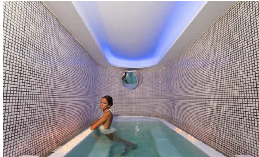
SCULPT & SHAPE