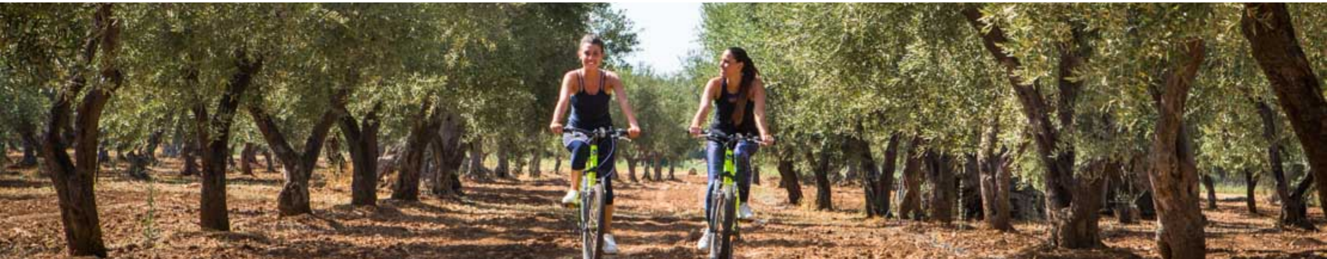
REMISE IN FORME