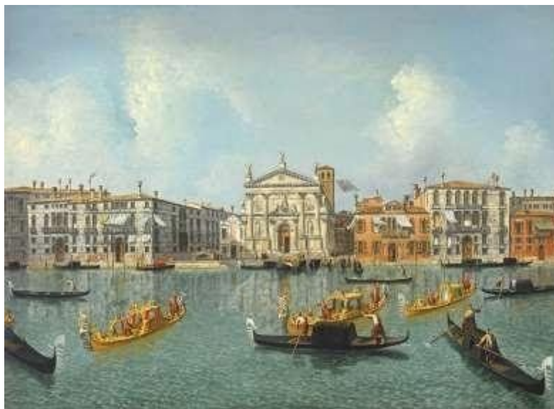
Michele Marieschi, Grand Canal with the Church of San Stae, eighteenth century private collection

The creation of the tempera paintings, adorning the walls and ceilings of the hallway that we see today, date back to the time when the building was fully restored. They recapture the essence of the fresco painted by Michelangelo Mortalier at Palazzo Grassi, and show convivial scenes of the Venetian world that bear witness to the life of the palace. The characters are portrayed facing towards a false wooden balcony and a false loggia appears in the background. The scenes, designed to be viewed from below and from a distance, are thought to have been carried out after the demolition of the stepping stones that connected the two wings of the mezzanine floor above the marble staircase. Reading the surveys conducted during the restoration has shown that many pigments used in the creation of the paintings such as zinc white, artificial ultramarine blue and chrome yellow, as well as inorganic binders with carbonated lime combined with plaster, were used only in the second half of the nineteenth century.