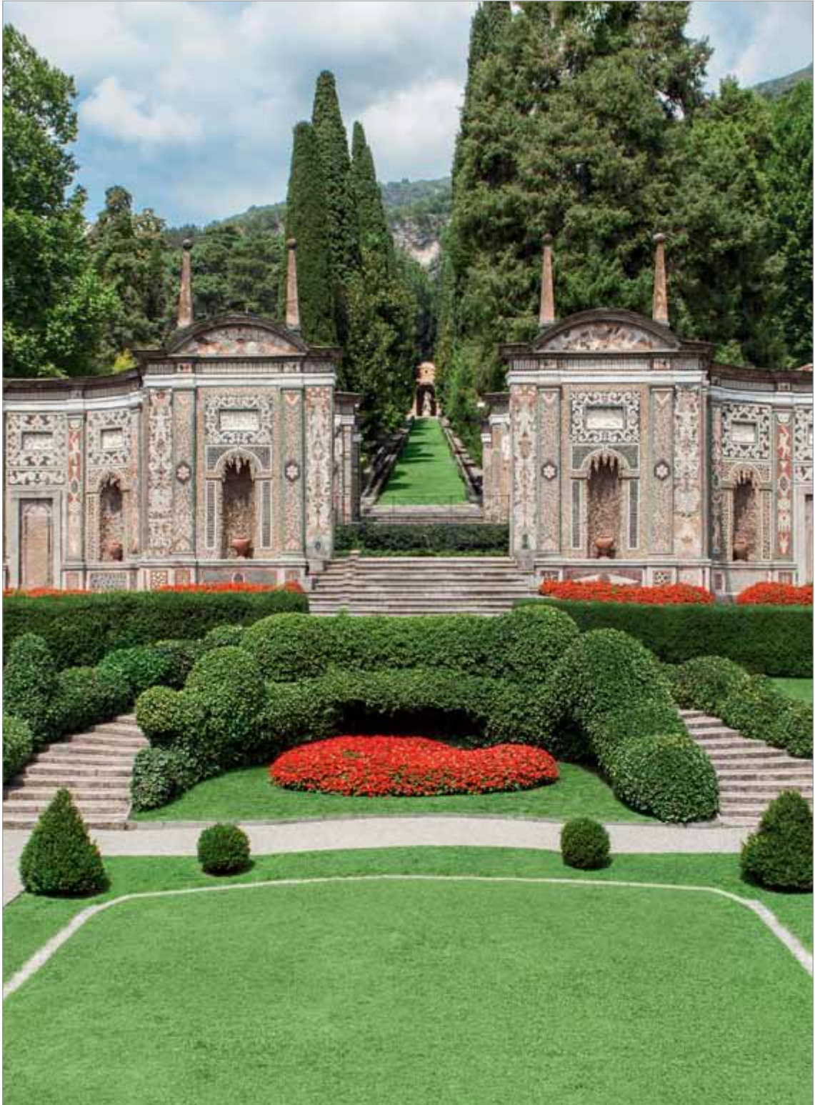
The Mosaic at Villa d'Este, an Italian national monument.