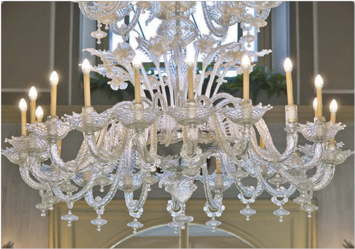
Grandeur and tradition.